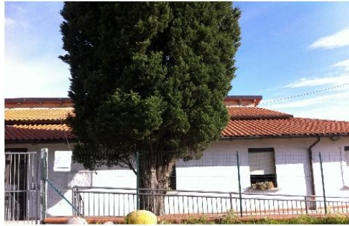
Poggio alla Malva's Kindergarten