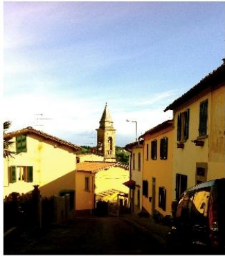
Poggio alla Malva