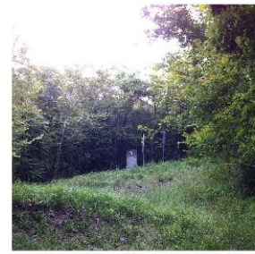
The memorial place for Ariodante Naldi