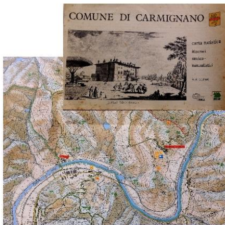
Old maps showing the "hidden" pathway